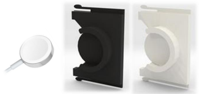
Available in Black or White